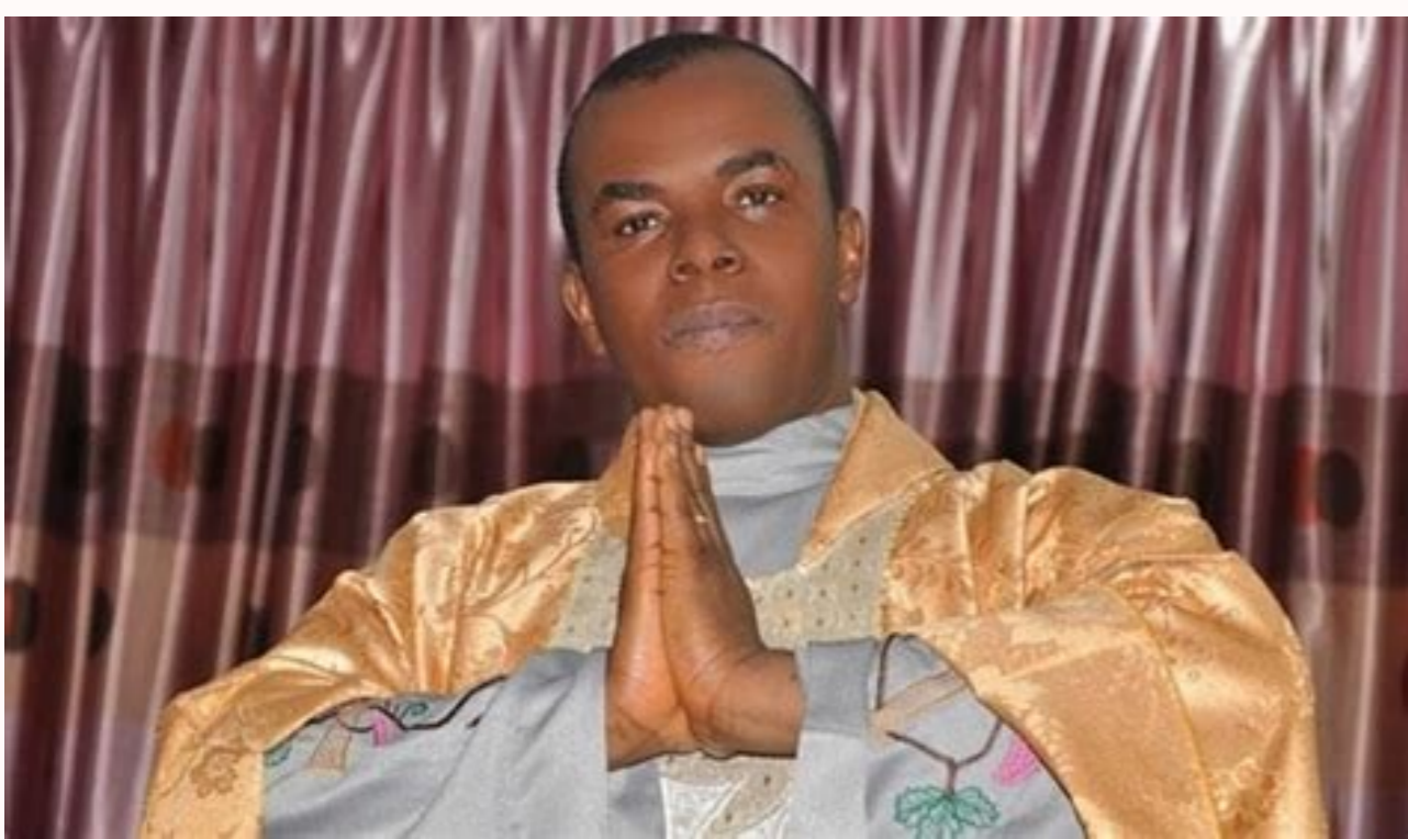
Chidera by father mbaka mp3 download.